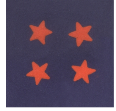
Four Stars (I)