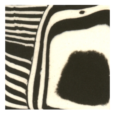
Black Knot (2)

These images are available in 2" tiles only.